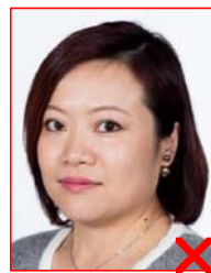
The subject must be facing forward, without any head angle