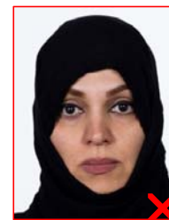
Head-coverings must not cover the face – same with hair