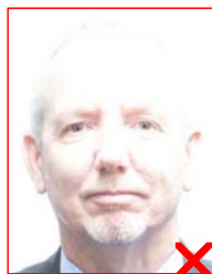
Incorrect image exposure– images cannot be too light or too dark