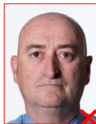
The face and background must be shadow-free