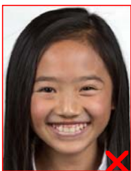
Smiling is not permitted – must be a neutral expression