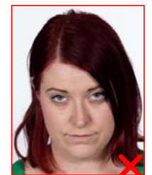
Head must not be tilted down or up